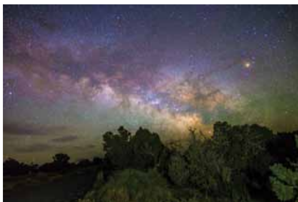
Dark Sky at Dead Horse Point by Bettymaya Foott

shielded fixture which directs light downward. Dark Sky Places also agree to work with neighboring land owners to promote dark sky conservation. Educational programs on the effects of artificial light at night and the importance of dark sky conservation are also agreed to. So why celebrate? All of Utah's International Dark Sky Places have made these agreements which means this huge swath of Utah's night sky will be protected, ensuring future generations the opportunity to view our incredible views of the Universe beyond. So let's all get out underneath a blanket of stars and enjoy our splendid night views with a bit of celebration!