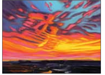
Spirit by Sandi Snead

Art inspired by life. "Points of View" reveals the way these artists see and interpret the world. During the eight-week exhibition, paintings will be available for purchase as well as prints and note cards.