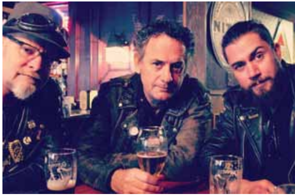
The Wicked Tinkers

Or you can pay at the Gate: Admission is $20 for the 3-day pass or $10 for a single day pass.