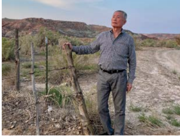
In September, actor and activist George Takei visited the Moab Isolation Center, where Japanese-American men were held in isolation during WWII. Takei was in Moab to narrate 'Lost Freedom: A Memory,' based on his own experiences in confinement as a child. KZMU News produced several interviews and a feature.

And through it all, KZMU has been here to provide up to date disaster