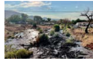
Flooding in Pack Creek this summer sent ash-laden debris down the entire drainage. KZMU News covered this event, and the nearly 9,000 acre fire that contributed to this situation.

bring diverse voices and content to our airwaves - from timely local news stories to long-form interviews from underrepresented people in our community.