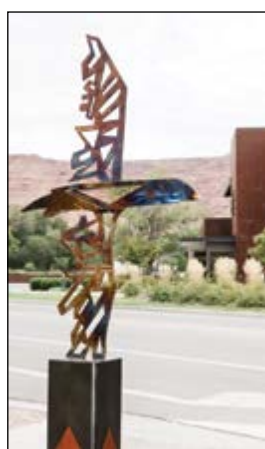
In Flight by Pamela Ambrosio