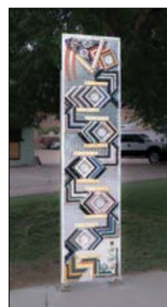
Rattlesnake Shake by Jimmy Descant