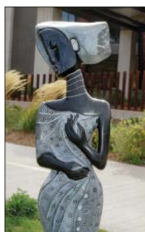
The Fashionista by Gedion Nyanhongo