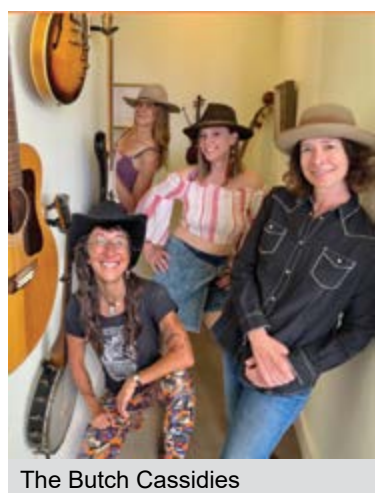
The Butch Cassidies

Attendees can look forward to an impressive roster of performances and activities designed to inspire and uplift. The musical lineup is packed with talent, featuring headliner