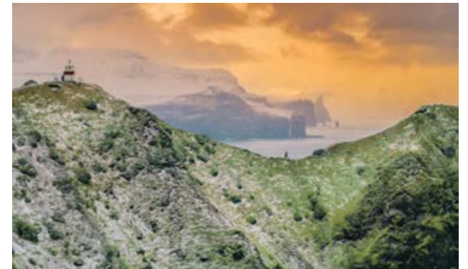
The Running Pastor

stateparks.utah.gov/parks/edge-of-the-cedars