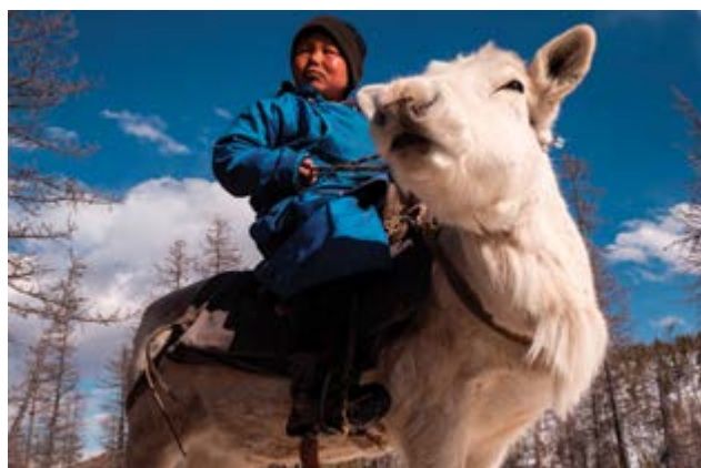
Bayandalai - Lord of the Taiga

Second Chance Wildlife Rehabilitation is a non-profit organization located in Price, UT that provides wildlife rehabilitation services for southeastern and south-central Utah. Although they rehabilitate many different types of wildlife, raptors are their specialty. Over half their patients