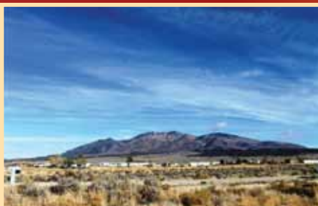
SEVERAL LOTS AVAILABLE in LA SAL 1.22 to 5.52 acres | $30,000.-$60,000. CALL FOR COMPLETE LIST 435-259-7488